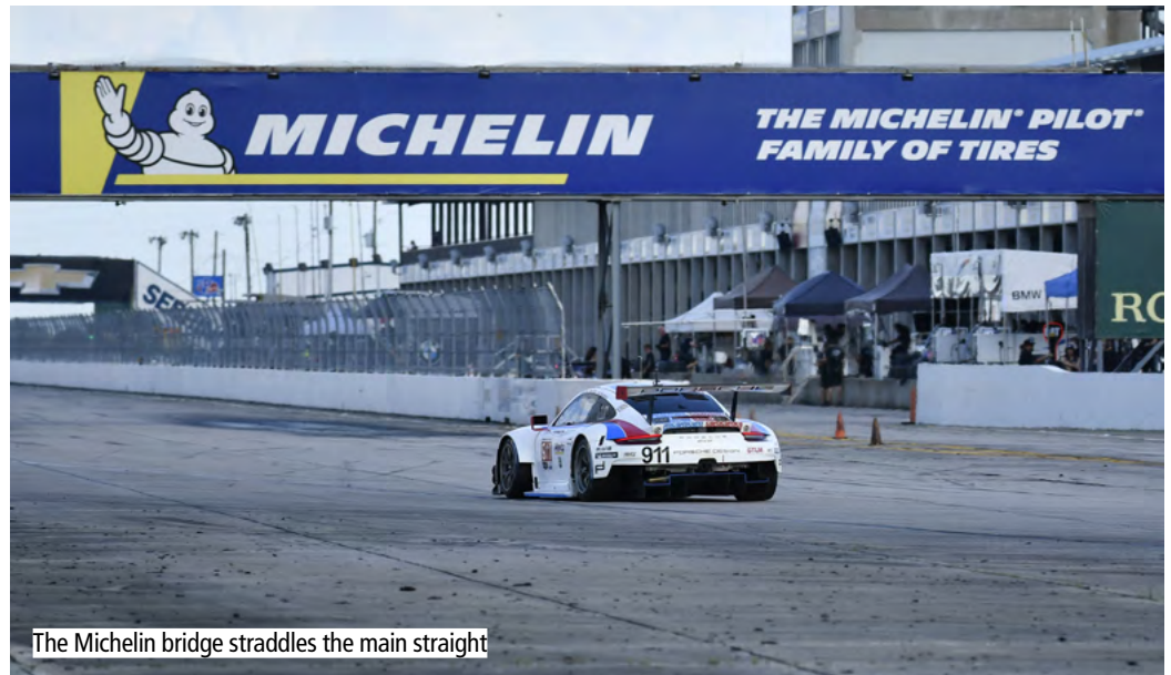
The Michelin bridge straddles the main straight