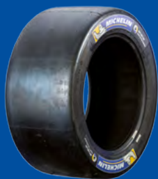
SLICK SOFT - MEDIUM - HARD