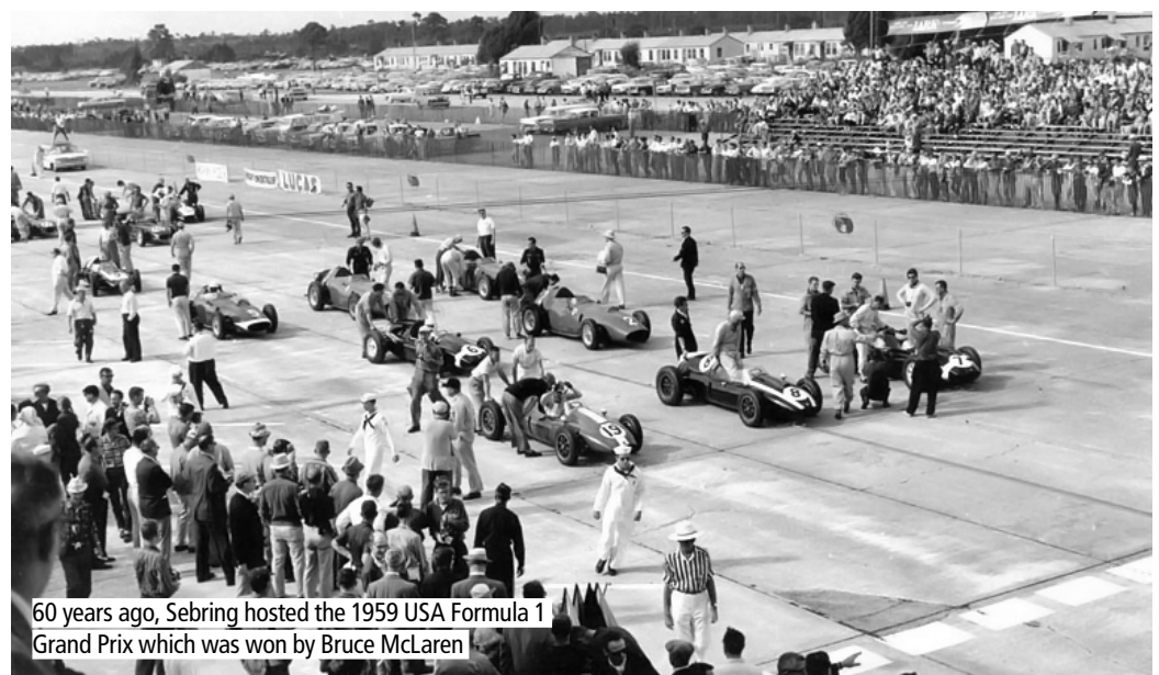
60 years ago, Sebring hosted the 1959 USA Formula 1 Grand Prix which was won by Bruce McLaren