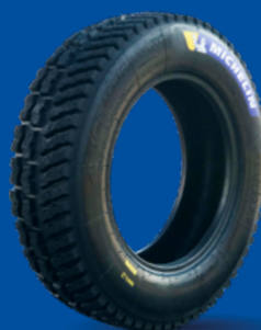
X-ICE NORTH 3

Size: 15/65-15 Conditions: ice and/or snow