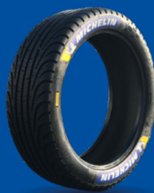
FW3 (FULL WET)

Size: 20/65-18 Conditions: icy, frosty, damp, cold conditions