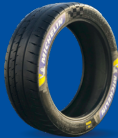
S6 (SOFT COMPOUND)

Size: 20/65-18 Conditions: wet, cold conditions