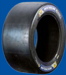
SLICK SOFT - MEDIUM - HARD