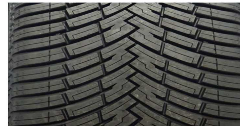
PIRELLI CINTURATO ALL SEASON SF2 205/55 R16 94V XL M+S