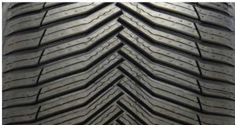
MICHELIN CROSSCLIMATE 2 205/55 R16 94V XL M+S

TESTED TIRES – 205/55 R16 - Extraction of Report CPA MARK21B (20CPA11-277)