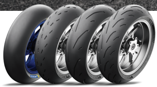
From left to right, MICHELIN Power MotoGP™, MICHELIN Power Cup², MICHELIN Power 6P², MICHELIN Power 6