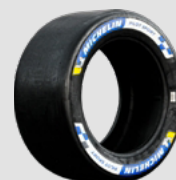
SLICK SOFT COLD, SOFT HOT, MEDIUM

Michelin tires are the preferred choice of all the LMGTE Am teams