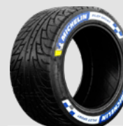
WET DRYING WET, FULL WET

Medium: for abrasive track surfaces and/or temperatures in excess of 30°C.