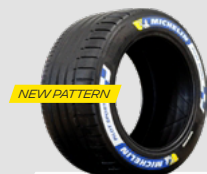
WET FULL WET

Medium: abrasive track surfaces, demanding track configurations, temperatures in excess of 30°C.