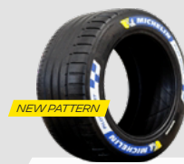
WET FULL WET

Medium: abrasive track surfaces, demanding track configurations, temperatures in excess of 30°C.