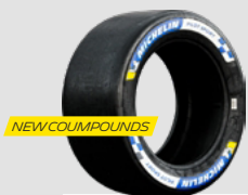
SLICKS SOFT COLD, SOFT HOT, MEDIUM

A new range of MICHELIN Pilot Sport Slicks.