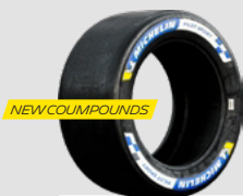
SLICKS SOFT HOT, MEDIUM

A new range of MICHELIN Pilot Sport Slicks.