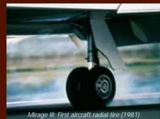
Mirage III. First aircraft radial tire (1981)

virtually every type of ground transportation and, of course, we were the first to develop radials for aircraft. Our tires were on Lindbergh's famous flight across the Atlantic, and they've been on every NASA Space Shuttle since the first launch. But since we're never satisfied with the status quo, we're just getting started.